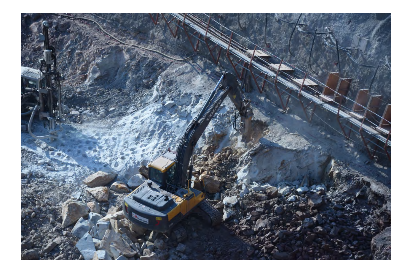
Nam Ngum Dam expansion is going on